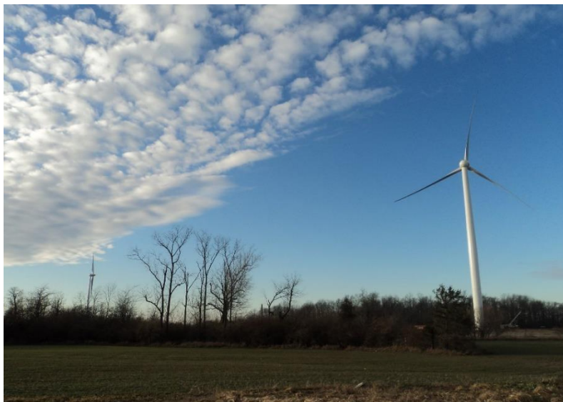
One Energy's turbines produce real power as the wind spins their rotors.

Solve for the other two sides (apparent power and real power) and the unknown angle. Note: the triangle is not drawn to scale.