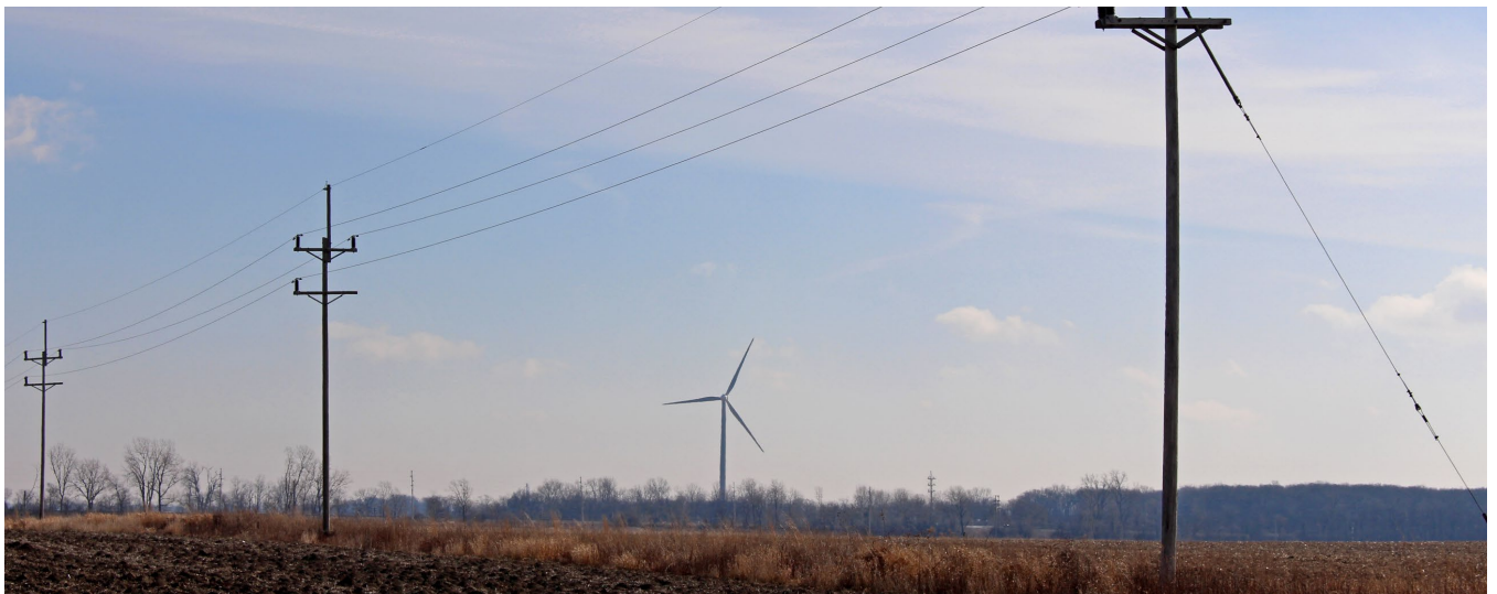
Marathon Petroleum Corporation, 1.5 MW Harpster, Ohio 2016