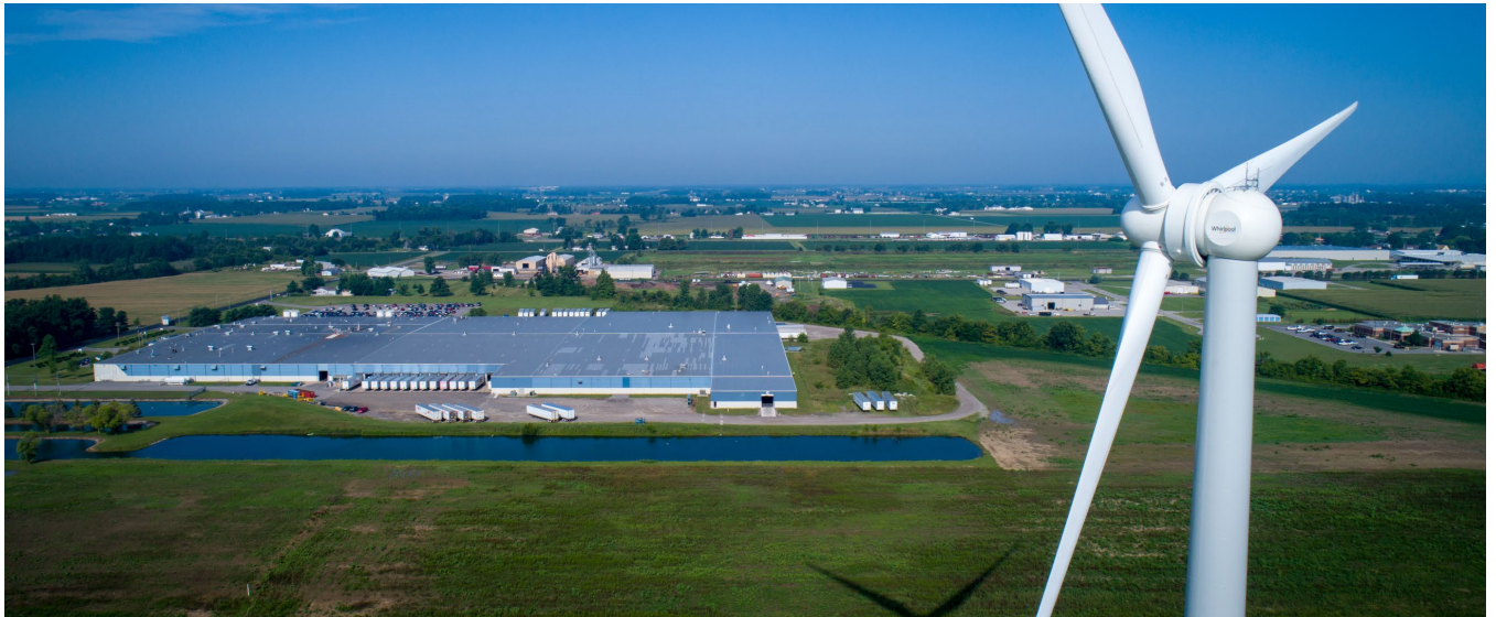
Whirlpool Corporation, 1.5 MW Ottawa, Ohio 2018