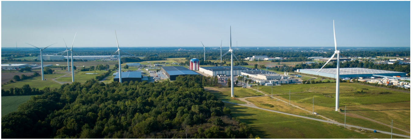
Ball Corporation 2.0, 4.5 MW Findlay, Ohio 2020