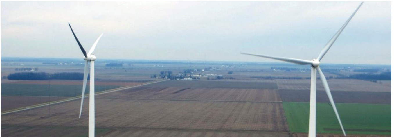
Haviland Plastics, 4.5MW Van Wert, Ohio 2012