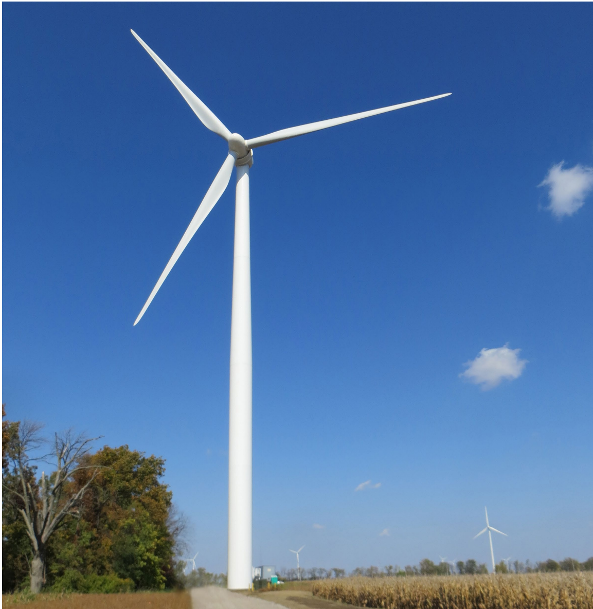
Cooper Farms, 4.5 MW Van Wert, Ohio 2011 and 2012