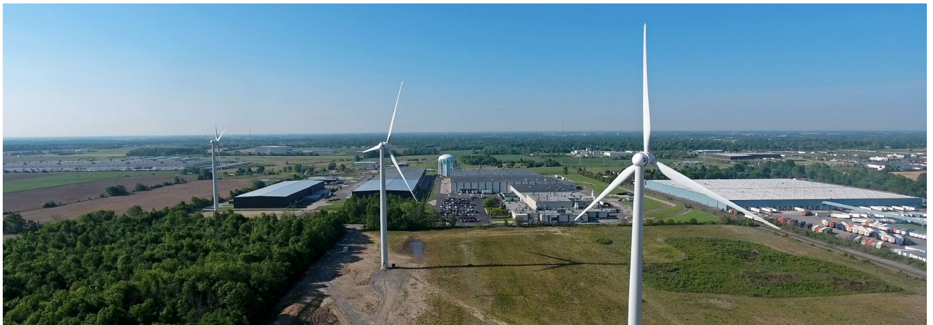
Ball Metal Corporation, 4.5 MW Findlay, Ohio 2015