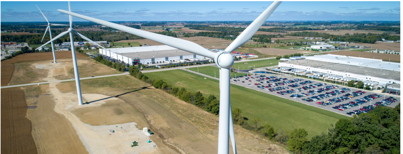
Whirlpool Corporation, 4.5 MW Greenville, Ohio 2018