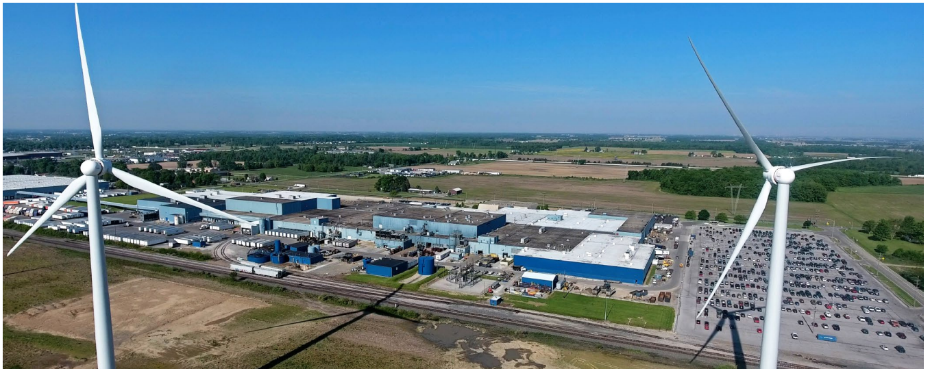
Whirlpool Corporation, 3.0 MW Findlay, Ohio 2015