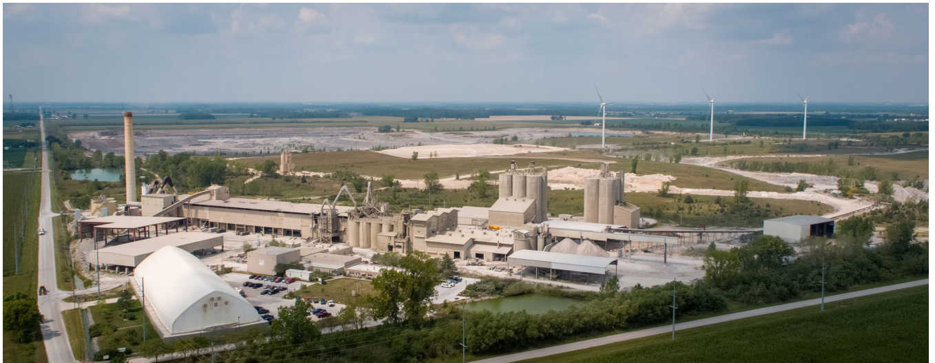
Lafarge Holcim, 4.5 MW Paulding, Ohio 2020