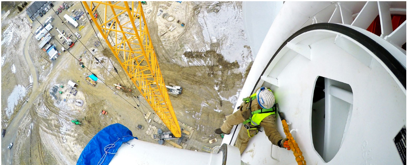
From the front of the generator, a worker prepares to receive the completed rotor (pictured on following page). For safety, the worker always wears a harness and is tied off when working at elevation.