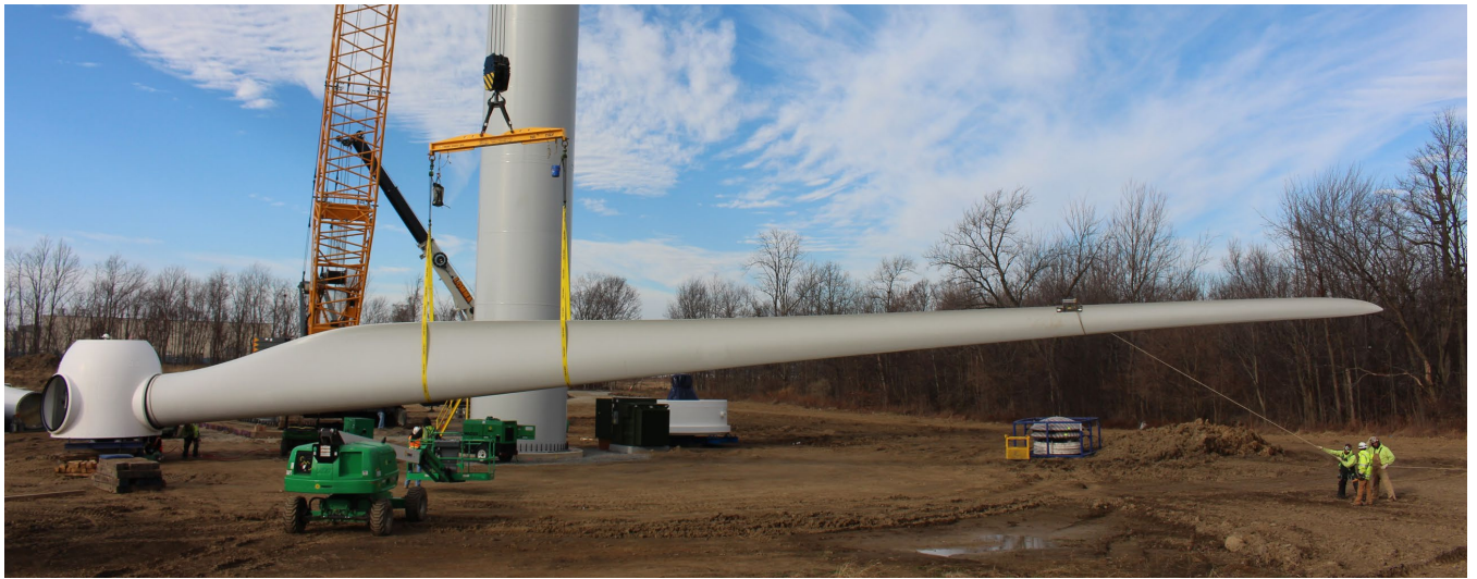
The three blades, each 140 feet long, are bolted to the hub, forming the rotor.