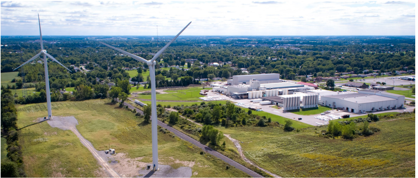
Valfilm Corporation, 3.0 MW Findlay, Ohio 2018