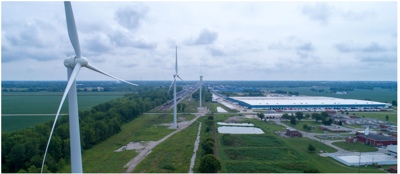
Whirlpool Corporation, 4.5 MW Marion, Ohio 2017