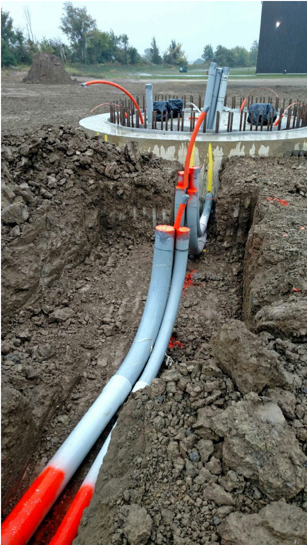
A trench is excavated below the turbine foundation for the low voltage conduit. Electrical conduits are installed in the trench and backfilled.